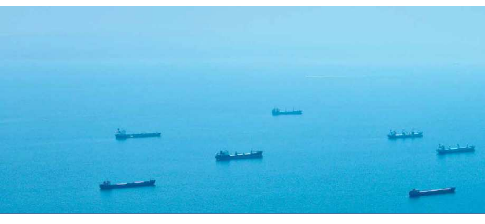
CHART TRACK EASYNAV

Since 1999, Chart Track has been successfully assisting Mariners to sail safely and efficiently.